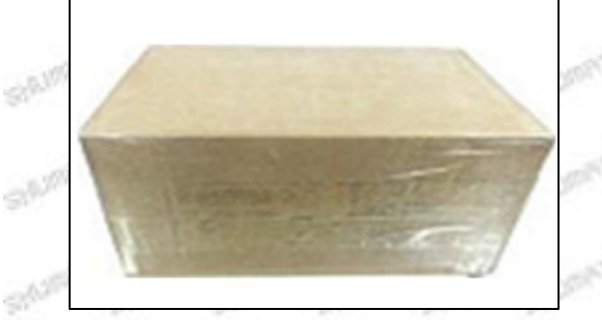
Pic No.2 Domestic express packaging: Wrapped by Transparent tape