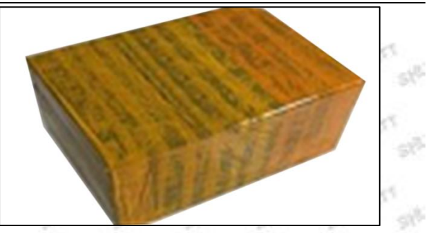
Pic No.3 International express packaging: Wrapped with yellow tape after wrapping black protective film